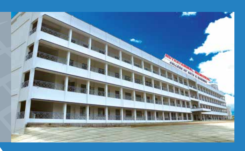
Muthayammal Memorial College of Arts & Science